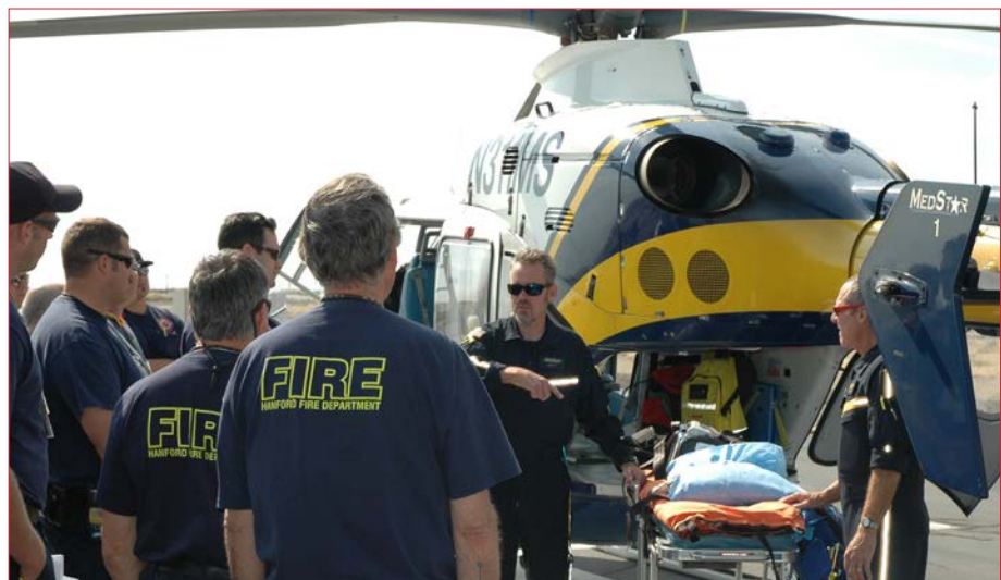
Hanford firefighters listen to MedStar's onboard flight nurse and respiratory therapist on what they need to know about the patient before they arrive on scene.