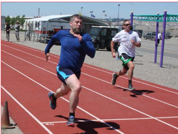
Potential recruits take part in the 40-yard dash as part of their physical assessment testing.

Physical aspects of tryouts required applicants to run one mile in eight and a half minutes or less, and run a 40-yard dash from a prone position in eight seconds or less. In the firearms category, candidates were administered a trigger-pull assessment test.