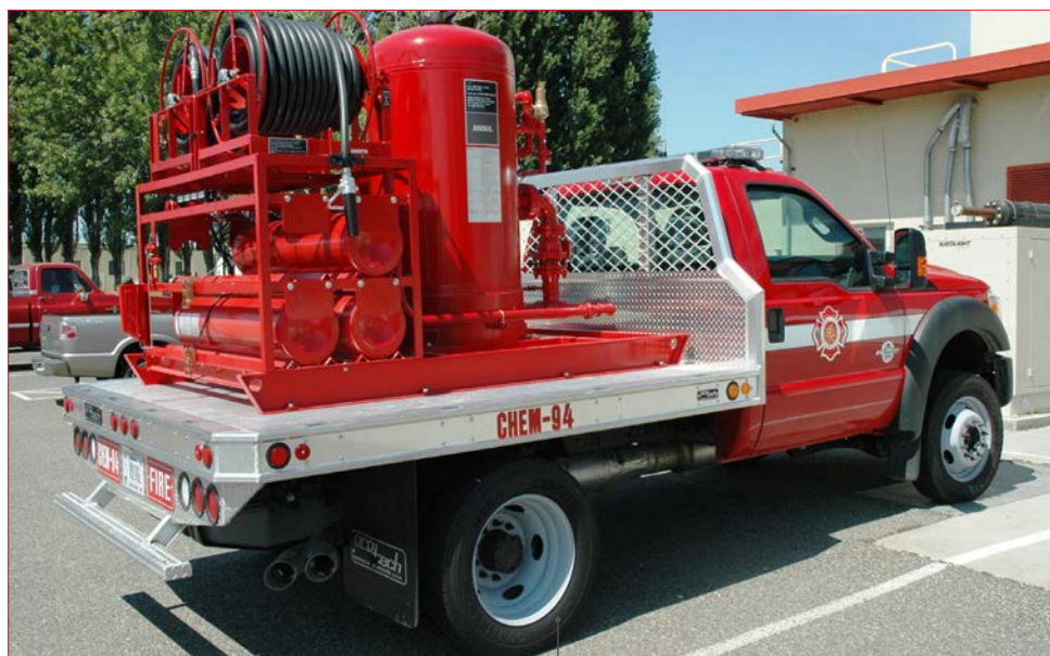
One of the new chemical trucks recently purchased for the Hanford Site.

HFD staff is being trained on the new chem truck apparatuses, which will be staged north and south of the Wye Barricade.