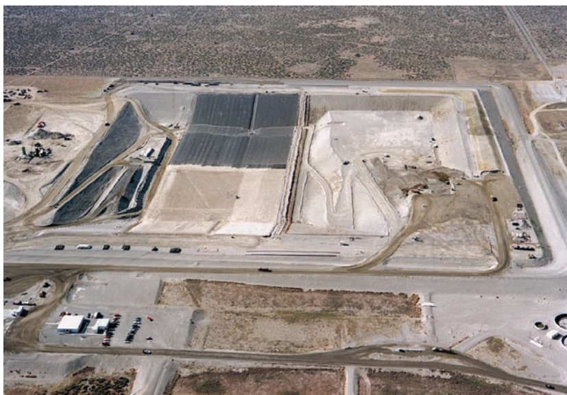
The Environmental Restoration Disposal Facility, located adjacent to the 200-West Area, was constructed to RCRA minimum technology requirements, including a double liner and leachate collection system.

The Central Waste Complex can store as much as 27,200 cubic yards of waste. This capacity is adequate to store the projected volumes of low-level, transuranic, and mixed waste, and radioactively contaminated polychlorinated biphenyls to be generated from Hanford Site cleanup activities assuming on-schedule treatment of the stored waste. Treatment will reduce the amount of waste in storage and make room for newly generated mixed waste. In 2008, the volume of waste stored at this complex totaled approximately 9,800 cubic yards.