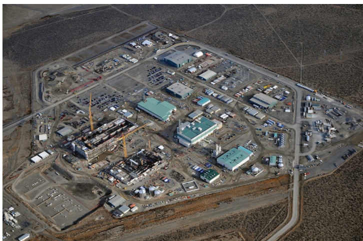
Construction on the Hanford Tank Waste Treatment and Immobilization Plant continued during 2008.

Hanford Tank Waste Treatment and Immobilization Plant. The Hanford Tank Waste Treatment and Immobilization Plant is being built on 65 acres adjacent to the 200-East Area. This plant will treat radioactive and hazardous waste presently stored in 177 underground tanks. Construction of the four major facilities continued in 2008: a pretreatment facility, a high-level waste vitrification facility, a low-activity waste vitrification facility, and an analytical laboratory, as well as supporting facilities. Overall, the project was approximately 45% complete at the end of 2008.