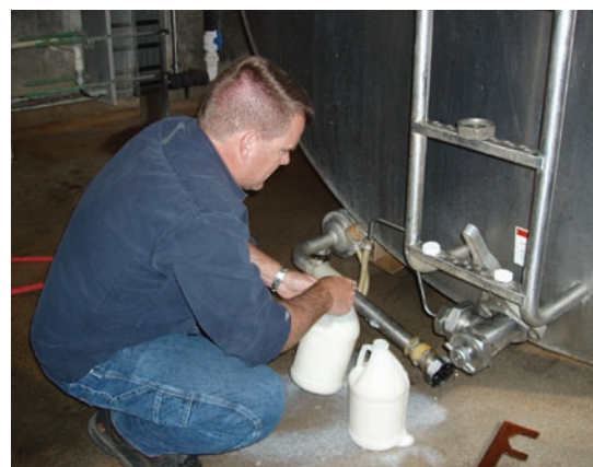
Milk samples were collected from dairies in the surrounding area.

In 2008, soil samples were collected near facilities and operations at the Hanford Site to evaluate long-term trends in the environmental accumulation of radioactive materials, to detect the potential migration of contaminants, and to monitor the deposition of facility emissions. Samples were analyzed for radionuclides expected to occur in the areas sampled. In general, radionuclide concentrations in soil samples collected from or adjacent to operational areas and waste disposal facilities in 2008 were higher than the concentrations in samples collected farther away, and were higher than concentrations measured offsite in previous years. Generally, the predominant radionuclides detected were fission products in the 200 and 600 Areas and uranium in the 300 and 400 Areas.