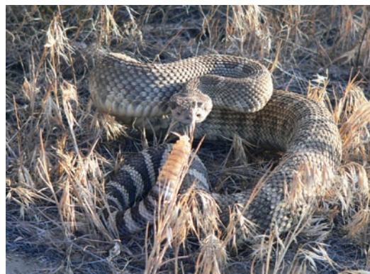
Rattlesnakes are observed during the summer on the Hanford Site.

Control of Pests and Contaminated Biota. Animals (including insects) must be controlled when they become a nuisance, potential health problem, or are contaminated with radioactivity. Biological control personnel responded to approximately 33,000 animal control requests from Hanford Site employees in 2008. There were 33 contaminated animals or animal-related materials discovered in 2008.