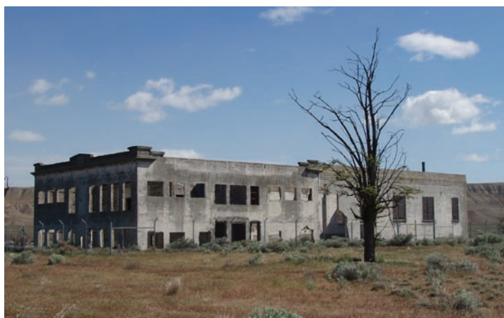
Hanford High School, one of the remaining buildings at the old Hanford town site, is eligible for listing in the National Register of Historic Places.

Cultural resources reviews are required before a federally funded, federally assisted, or federally licensed ground disturbance or building alteration/demolition project can occur. Cultural resource reviews identify properties within the proposed project area that may be eligible for, or listed in, the National Register of Historic Places, and evaluate the project's potential to affect any such property. During 2008, 113 cultural resource reviews were requested by Hanford Site contractors.