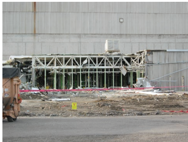
K-East Basin structural steel demolition occurred in July 2008.

K-East and K-West Reactors. For nearly 30 years, these basins contained 2,300 tons of Hanford Site N Reactor spent fuel and a small quantity of irradiated single-pass reactor fuel from older site reactors. This fuel was removed in a major effort that ended in 2004 but fuel corrosion left behind sludge and debris. During 2008, K Basins cleanup continued with the removal of debris from both the K-East and K-West Basins. All sludge from the K-East Basin was removed, completing deactivation and allowing the start of decommissioning activities, including the demolition of the K-East Basin structural steel superstructure.