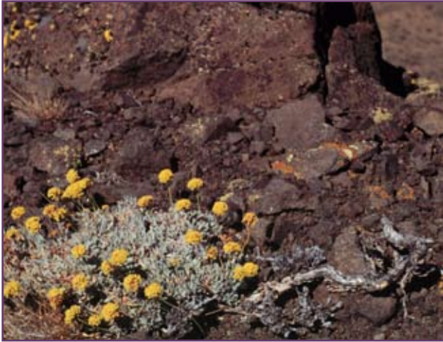
Umtanum desert buckwheat is a plant species proposed for federal listing as threatened or endangered.

The Hanford Site is a relatively undeveloped area of shrub-steppe habitat (a drought-resistant, shrub and grassland ecosystem) that contains a rich diversity of plant and animal species. This area has been protected from disturbance, except for fire, over the past 60 years. This protection has allowed plants and animals that have been displaced by agriculture and development in other parts of the Columbia Basin to thrive at Hanford.