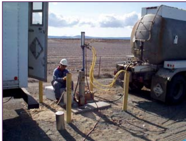
Groundwater samples were collected from 687 wells and 128 shoreline aquifer tubes to monitor contaminant concentrations. Water levels were measured in several hundred wells on the site to map groundwater movement.

Flying insects and insect material are also collected during operations on the Hanford Site and tested for radiological contamination. Only one of the