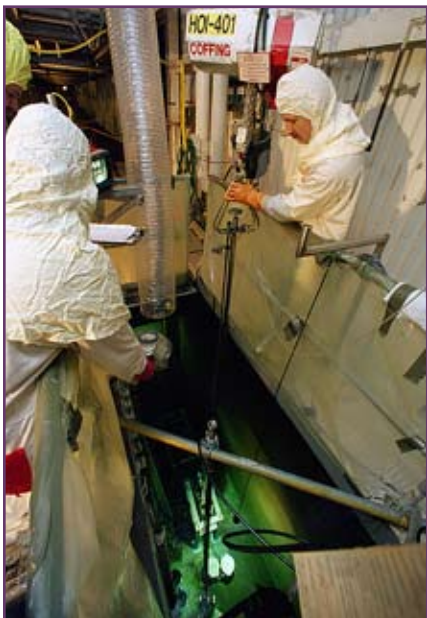
All of the spent fuel has been removed from the K-Basins and workers are now focused on removing the remaining sludge and debris.

100 Areas Waste Sites. Full-scale remediation of waste sites began in the 100 Areas in 1996 and continued in 2005 at the 100-B/C, 100-K, 100-N, 100-D, and 100-F Areas, and in the 100-IU-2 and 100-IU-6 Operable Units (The 100-IU-2 and 100-IU-6 Operable Units cover areas near the Hanford town site. A total of 929,802 tons of contaminated soil from 100 Areas remediation activities were disposed at the Environmental Restoration Disposal Facility (near the 200-West Area) during 2005. Pump-and-treat systems operated to help remove contamination from groundwater. A summary of 2005 groundwater pump-and-treat operations is shown in the table on the following page.