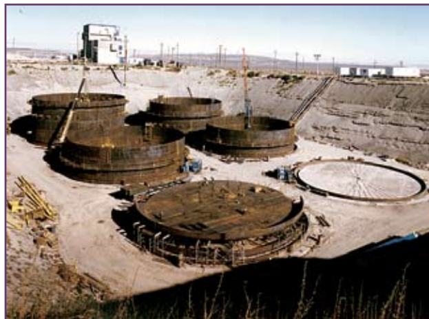
This photograph shows construction of six double-shell tanks being built in the 200 East Area of the Hanford Site in about 1975.