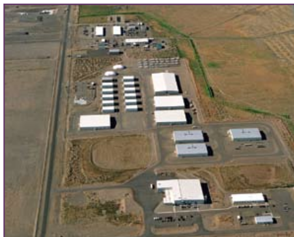
The Central Waste Complex receives waste from Hanford Site cleanup activities and from other DOE and Defense Department facilities.

Liquid Waste Management. Facilities are operated on the Hanford Site to store, treat, and dispose of various types of liquid