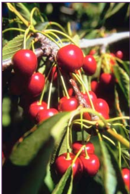
Samples of cherries and other agricultural crops were collected during 2005.

Two dust storms were recorded at the Hanford Meteorology Station during 2005. There has been an average of five dust storms per year at the Hanford Meteorology Station during the entire period of record (1945-2005).