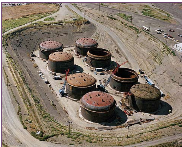
The 177 radioactive waste storage tanks were built at the Hanford Site between 1943 and 1985.

Non-dangerous waste is waste that does not contain hazardous or radioactive substances. Non-dangerous waste generated at the Hanford Site historically was buried onsite. However, beginning in 1999, non-dangerous waste has been disposed of at an offsite landfill.