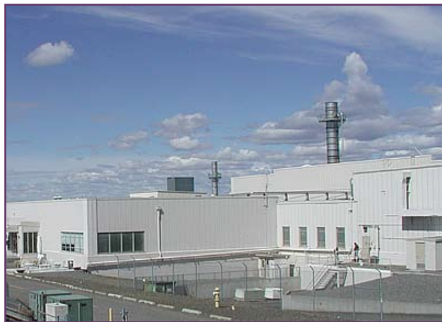
Facilities in the 300 Area are being decommissioned.

An access hole was drilled through the core support structure in the reactor vessel to insert a suction pump. This was a DOE first-of-kind effort in which a drill bit at the end of a 50-foot-long drive line was used to drill into the stainless steel core support structure that was immersed in molten sodium. The drilling allowed access to molten sodium within the support structure