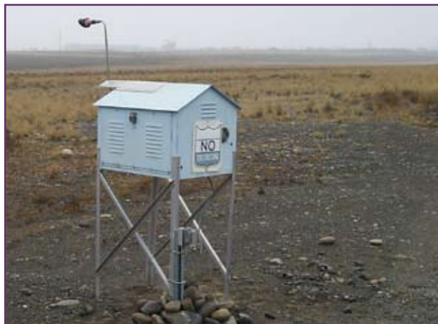
Air samplers on the site were located primarily around major operational areas to maximize the ability to detect radiological contaminants resulting from site operations.

The primary environmental and resource monitoring programs and projects at Hanford include the Effluent Monitoring Program, conducted by Fluor Hanford, Inc.; the Public Safety and Resource Protection Project, managed by the Pacific Northwest National Laboratory; and the Groundwater Performance Assessment Project, also managed by Pacific Northwest National Laboratory. Hanford Site drinking water is monitored for radiological contaminants by Pacific Northwest National Laboratory personnel through a contract with Fluor Hanford, Inc. The Biological Control Program is managed by Fluor Hanford, Inc.