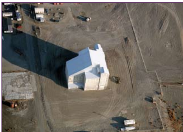
Interim safe storage of decommissioned reactors continued in 2005.

221-U Chemical Processing Facility. Removal of ancillary facilities at the 221-U Chemical Processing Facility began in November 2004 and demolition of 11 of the structures was completed in September 2005. The U Plant ancillary facilities decontamination and decommissioning project has lost its funding due to higher priority DOE needs and limited funding availability. Therefore, the CERCLA removal action for the U Plant ancillary facilities is on hold until additional funding is available.