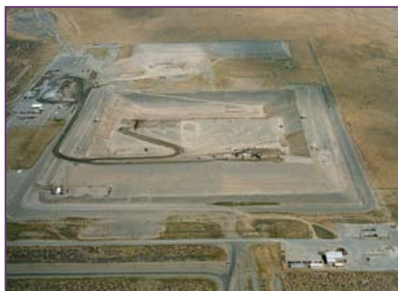
By the end of 2005, the Environmental Restoration Disposal Facility had received 6.3 million tons of contaminated soil and other waste from site cleanup operations.