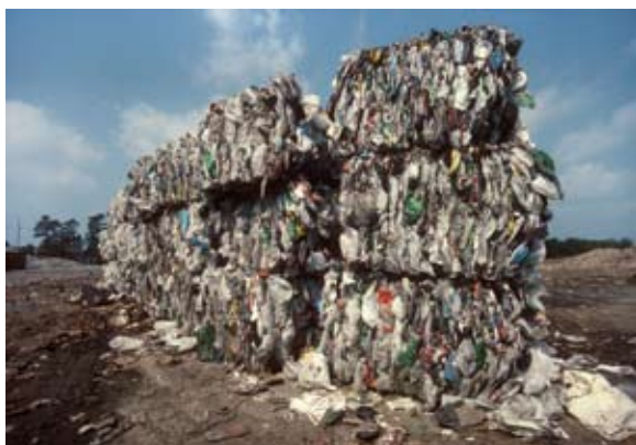
The Hanford Site met the fiscal year 2005 Secretarial Goals for recycling.

This program is a continuing effort to reduce the quantity and toxicity of hazardous, radioactive, mixed, and sanitary waste generated at Hanford. The program fosters the conservation of resources and energy, reduction in the use of hazardous substances, and prevention or minimization of pollutant releases to all environmental media from all operations and site cleanup activities. The purchase of environmentally preferable products containing recycled material achieved 100% of the 2005 goal at the Hanford Site.