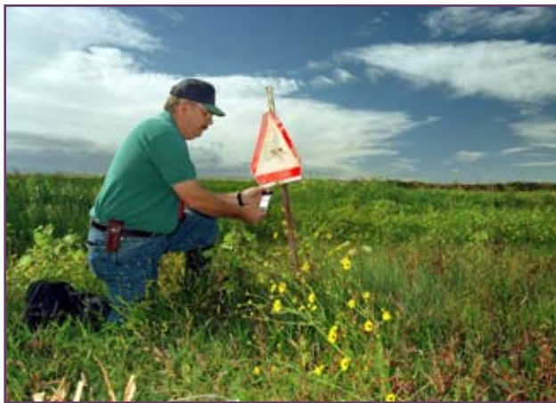
In 2005, scientists evaluated potential radiological doses to the public and biota resulting from exposure to Hanford Site liquid effluents and airborne emissions.

Radioactive air emissions usually come from a building stack or vent. In 2005, radioactive emission discharge points were located in the 100, 200, 300, 400, and 600 Areas.