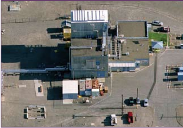
The 242-A evaporator processes dilute liquid tank waste into a concentrate.