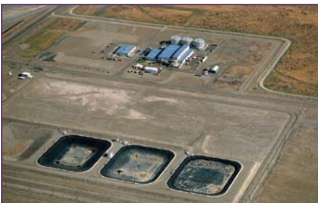
The three basins at the Liquid Effluent Retention Facility are lined with two, flexible, high-density polyethylene membranes.

waste generated by site cleanup activities. These facilities are operated and maintained in accordance with state and federal regulations and facility permits.