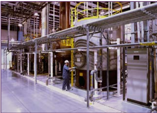
The Effluent Treatment Facility in the 200-East Area treated and disposed of 6.3 million gallons of waste water during 2005.