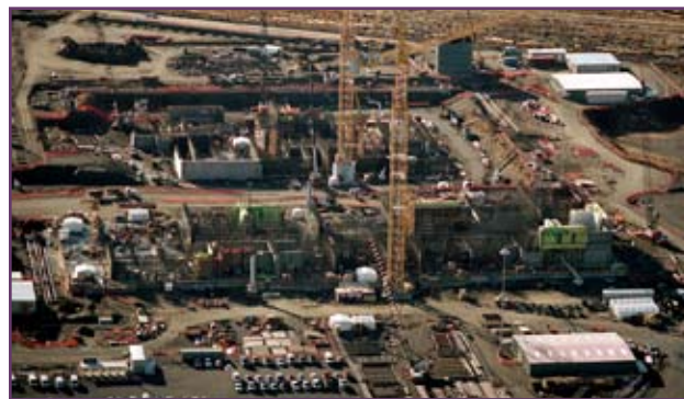
Engineering and construction activities for the Waste Treatment Plant progressed in 2005, although technical challenges and funding cuts slowed both design and construction.