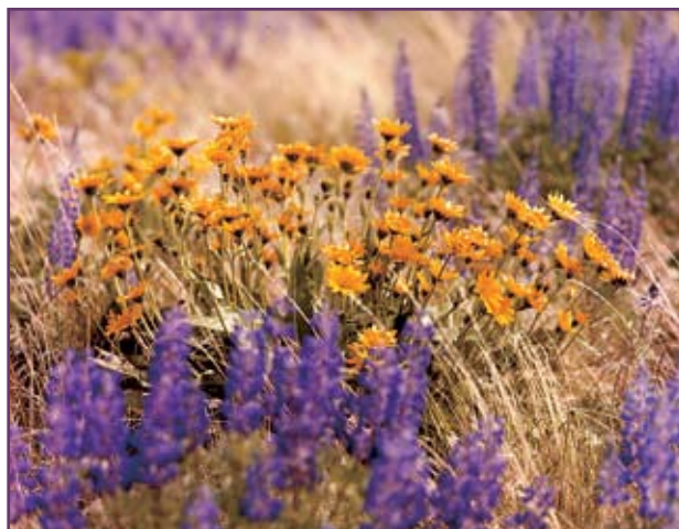
Cusick's sunflower (yellow) and the surrounding lupine (purple) are both native to the Hanford Site and can be found on the lower slopes of Rattlesnake Mountain in the Hanford Reach National Monument.

Columbia River Corridor. Activities continued during 2005 to clean up the Columbia River Corridor. Although risk assessments are usually done prior to cleanup activities, the regulatory agencies have granted interim records of decision to initiate cleanup first and postpone conducting risk assessments until a later date. In 2005, sampling began on the 100 Areas and 300 Area baseline risk assessment. Planning was initiated for the inter-areas component and the Columbia River component of baseline risk assessments. A website was created to provide information about past and ongoing risk assessments and cleanup activities along the river corridor. The site includes the dates of public involvement opportunities, documents available for review and comment, administrative information, and links to related projects. The website can be found at http://www.washingtonclosure.com/projects/endstate .