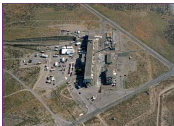
The T Plant complex operates under RCRA interim status. It provides waste treatment and storage and decontamination services for the Hanford Site.