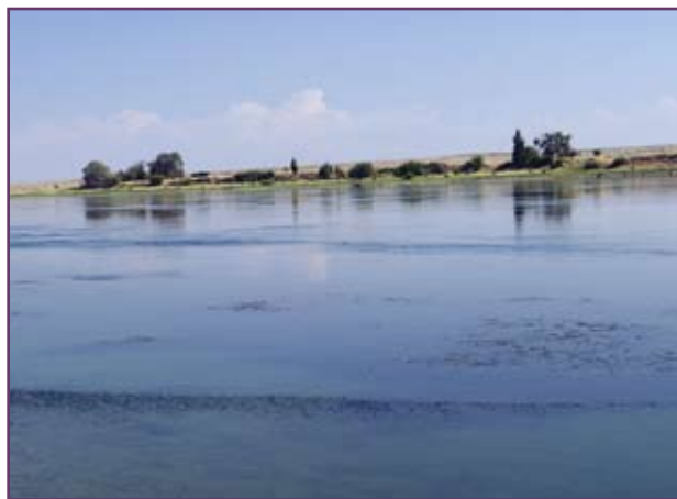
The mission of the DOE Office of River Protection is to retrieve and treat Hanford's tank waste and close the tank farms to protect the Columbia River Corridor.