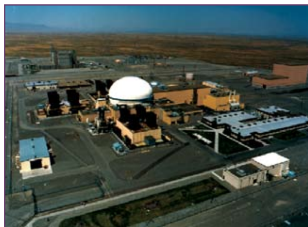
The Fast Flux Test Facility is being decommissioned.