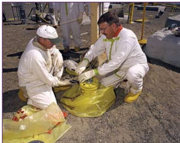
Some Tri-Party Agreement milestones completed in 2005 were related to work on Hanford waste storage tanks.

During 2005, 15 negotiated change requests to the Tri-Party Agreement were approved. These change requests may be viewed in their entirety in the Tri-Party Agreement Administrative Record at http://www2.hanford.gov/arpir/ .