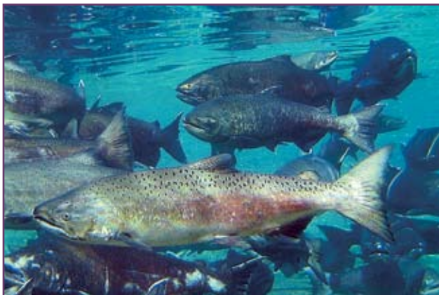
Chinook salmon spawn in the Hanford Reach of the Columbia River.

Reserve Unit of the Hanford Reach National Monument (e.g., Rattlesnake Springs, Dry Creek, Snively Springs) and West Lake, a small pond near the 200 Areas.