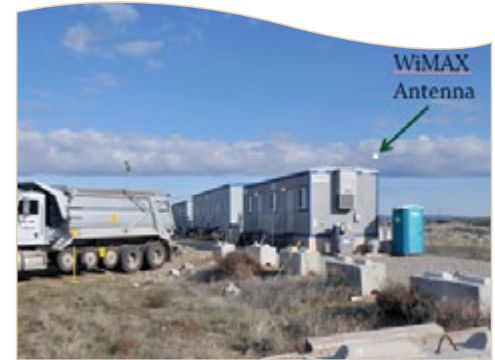
WiMAX is saving the environment and allowing for faster deployment of telecommunications abilities throughout the Hanford Site.

Information services are now being delivered to the point of performance at Hanford in days instead of months. This was accomplished by installing a robust wireless network so Hanford field forces could have site-wide access with sufficient bandwidth for voice, data and video requirements.