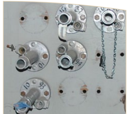
Manhattan Project-era nuclear reactor nozzles

While the establishment of a permanent solution for the curation, display, and storage of the Hanford Collection is in progress, a small sample of collected artifacts are currently held and on display at the B Reactor, CREHST Museum, and the Oregon Museum of Science and Industry (OMSI) in Portland, Ore. ■