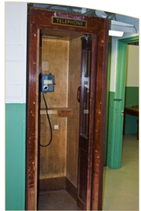
Manhattan Project-era Phone Booth

When MSA recovers the items, the contractual and legal obligations for the care and custody of the artifacts transfer to MSA from the facility's managing contractor. MSA then transports the