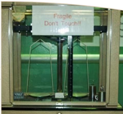
Manhattan Project-era Plutonium Scale

Some of these tagged artifacts are now on loan to the Columbia River